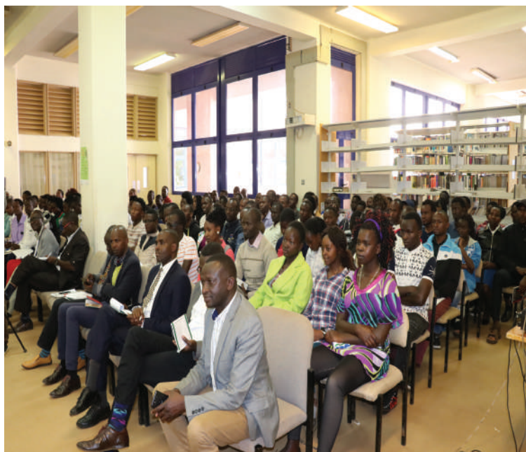
(Right) Moi University students during the Student Mentorship event.