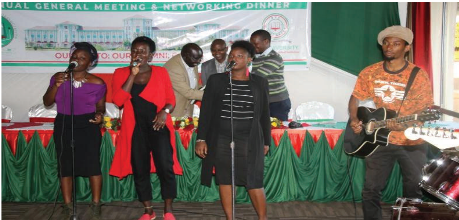
The Moi University Band entertaining guests