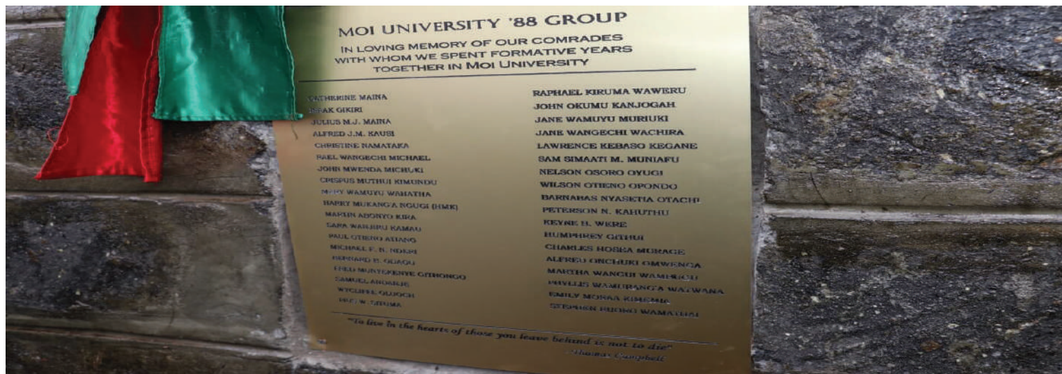
A memorial plaque with the names of the departed comrades of Class of 1992