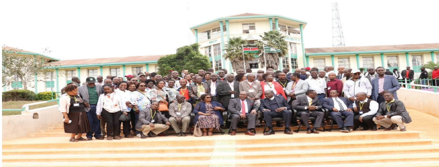
The Moi University Class of 1992 pose for a picture outside Moi University Administration Block during their homecoming celebration.

The first Alumni homecoming to Moi University was staged by the Class of 1992(MU'88) as a grand reunion homecoming on Saturday November 3, 2018. The reunion, aimed at bringing together the alumni Class of 1992 who joined the university on November 6, 1988, was a celebration of 30 years since their admission to the university. The event attracted more than 130 alumni travelling from all corners of the globe to attend.