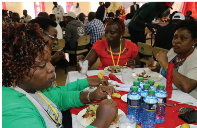
Class of 1992 alumni taking their breakfast in Moi University Cafeteria during their homecoming