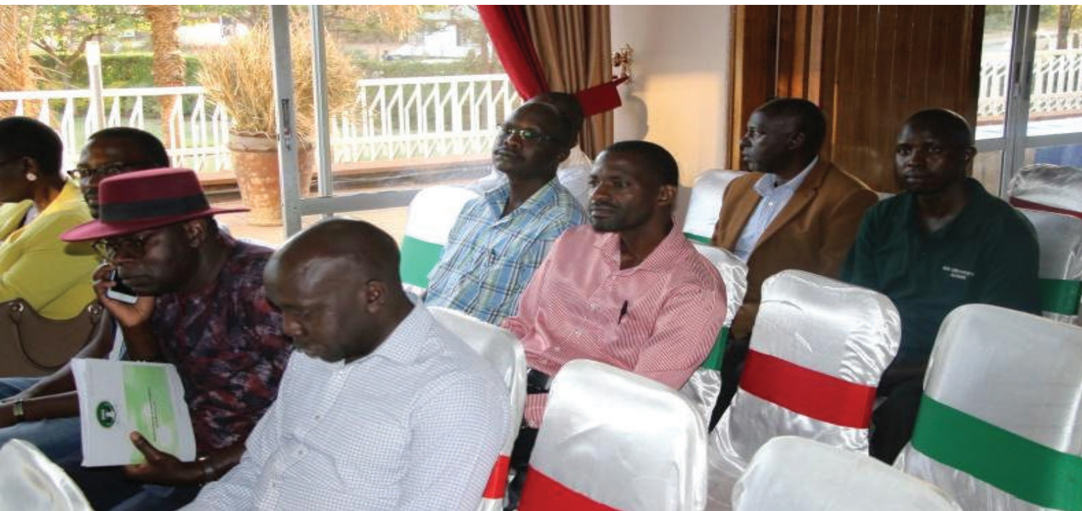
Participants during the 2019 Alumni Annual General Meeting